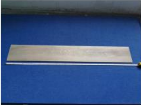
Front View (Test Surface)