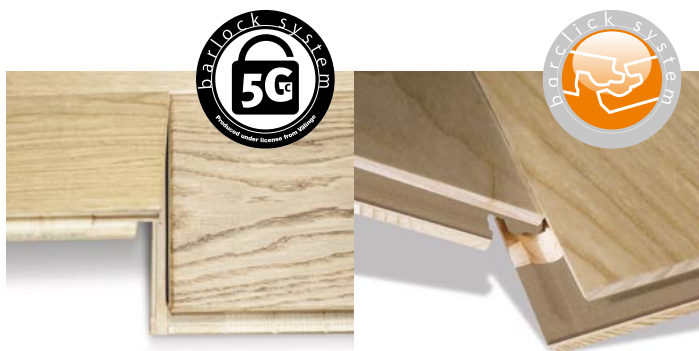
Fig. 2. Views of Barlinek floorboards with 5Gc BARLOCK and BARCLIK systems